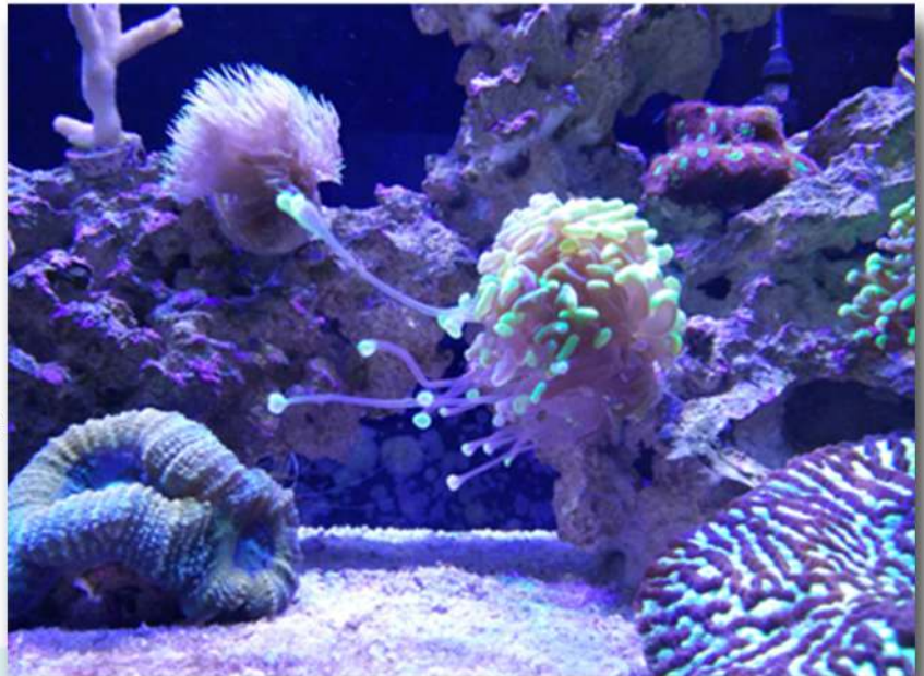
Stinging Sweeper Tentacles