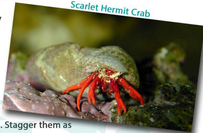
Scarlet Hermit Crab