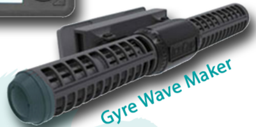
Gyre Wave Maker