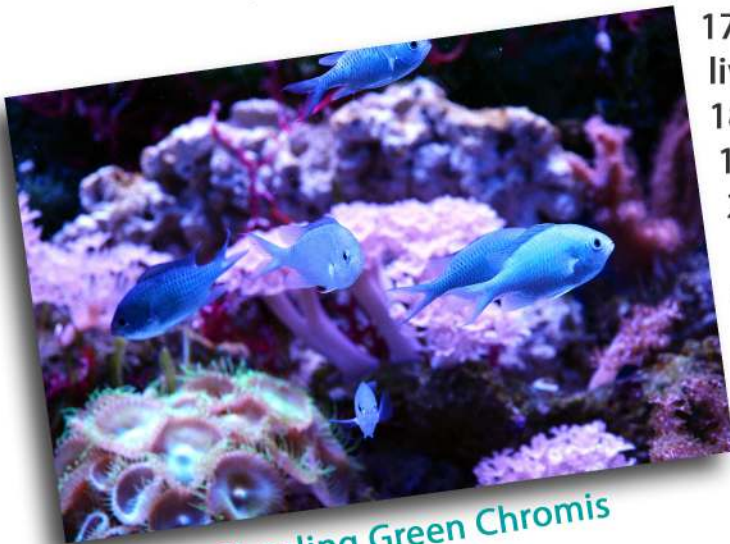
Shoaling Green Chromis